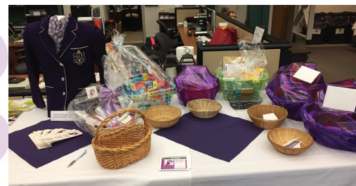
The first meeting of the new Alpha Literary Society offered members the chance to win a prize from the raffle basket and receive a free book. Alpha Delta Kappa alumnae are invited to participate in the events of the new organization by assisting in various campus and community activities in support of the Sheard Literacy Center.

and residents of local nursing homes. The group may also host a book club to allow members to express and perhaps even find their love of literacy. The organization plans to utilize the skills of Alpha alumnae to help better prepare the next generation of teachers. To that end, the students and alumnae are working together on plans for a career development event to take place in fall 2017.